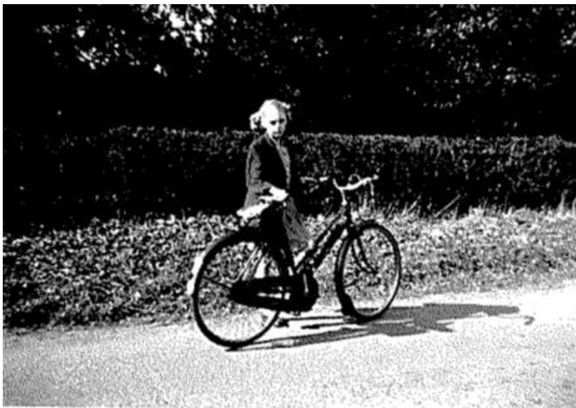
Mum with her bike in 1948

However, most journeys of any distance were by bike. Places mum and grandad went on their bikes 2 included Alfreton, Bestwood, Blackwell, Calverton, Clipstone, Edwinstowe, Epperstone, Gibbet Dale, Huthwaite, Jubilee Hill 3 , Linby 4 , Longdale, Mansfield (including Mansfield Reservoir), Mansfield Woodhouse, Mill Lane, Moorgreen, Newstead, Ollerton, Oxton, Papplewick, Pinxton, Pleasley, Pleasley Vale, Pye Bridge, Selston, Sutton, Teversal and Underwood. Most of these places are within a radius of around eight miles. Some of the places they cycled to were further than this, e.g. Epperstone, Ollerton, Calverton and Oxton. 5