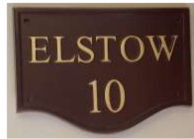
Mum's Elstow sign from Rowan Gardens hence the 10. This came to me when she died and is displayed on the wall in my study