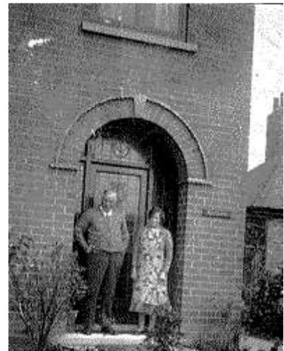
Above left – 96 and 98 Welbeck Street