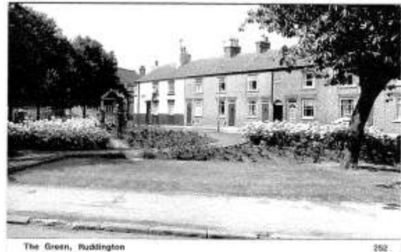
The Green, Ruddington