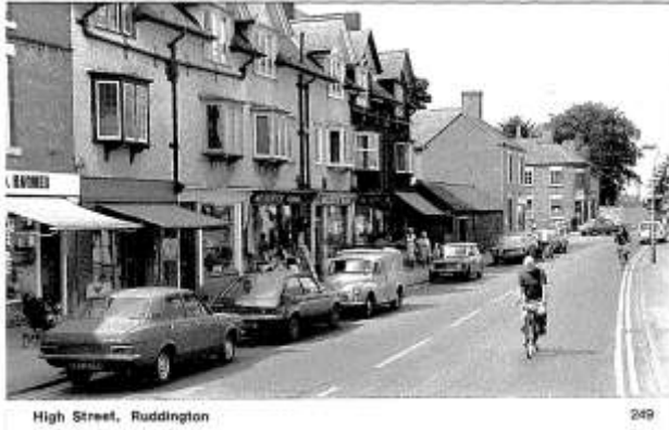
High Street, Ruddington