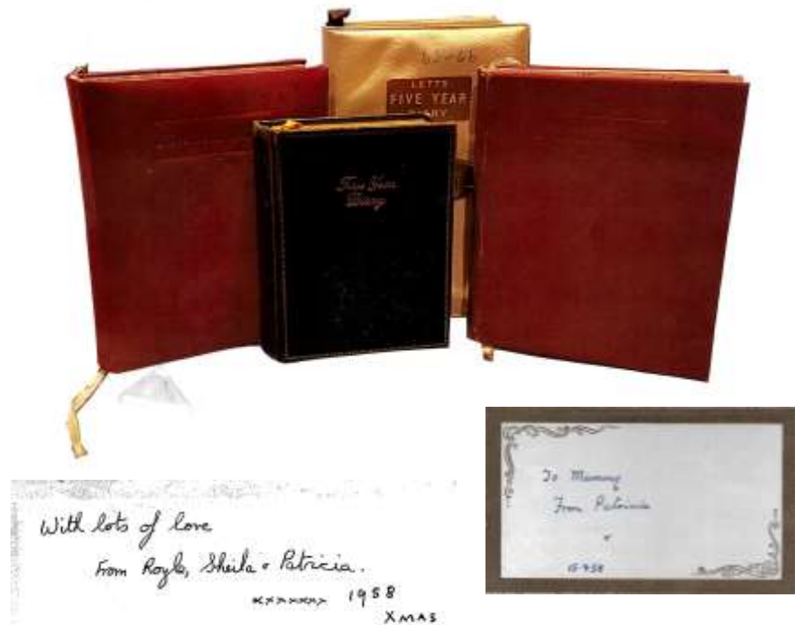
Top – mum's and grandad's five-year diaries 1959-68 Above left – annotation in grandad's first five-year diary Above right – sticker in mum's first five-year diary Below left – grandad's notes on cost of building bungalow in Drayton

Mum's second five-year diary, the white Letts one, was a Christmas gift in 1963.