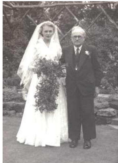
Top row – mum and dad at their wedding Above – these photos, including the one with grandad (right), were taken at a later date, in August 1956, when he was feeling better.