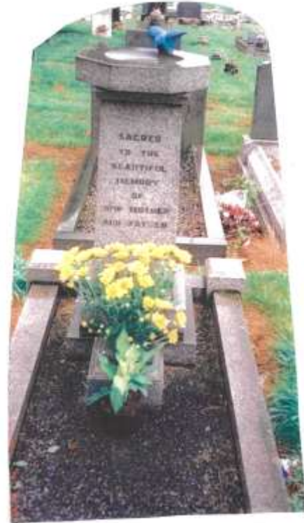
Views of the grave of Charles and Jane Cirket