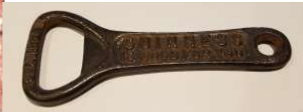
Left – replica sign advertising that Guinness is good for you Above – vintage bottle opener with the same slogan

Almost all family members had problems with their teeth and by the start of this period, when grandad was in his early 20s, he already had some dentures. This period preceded the formation of the UK's National Health Service so the family needed either to pay for medical treatment or had to contribute to some form of health insurance. Grandad noted doing the latter. It seems he started doing this in November 1920 and expanded this to include mum in 1938 by paying an extra 2d per week.