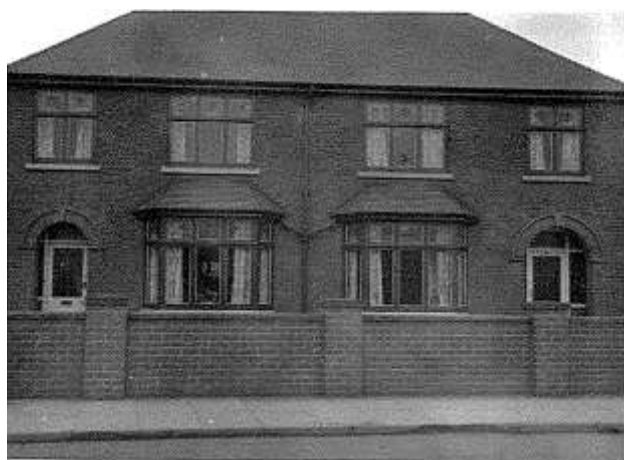
96 and 98 Welbeck Street

For mum, this was a time of transition. She left school in 1950 and worked in various roles during this period. She first mentions dad in October 1952 and, by September 1954, they were engaged.