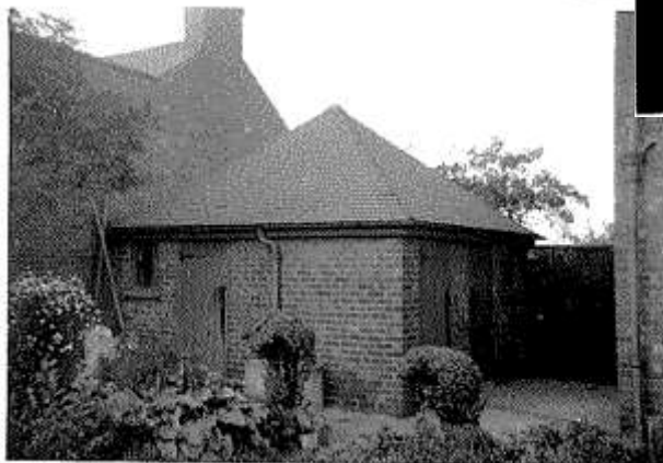
Top left – 96 Welbeck Street Top – Welbeck Street circa 1951 – this road was opened up in June 1952 and tarmacked in January 1953 Above – gardens in preparation at 96 Welbeck Street Left – grandad's "cabin" which included a coalhouse and a workshop

There were intensive preparations for the Parkins to move and these started as soon as the Smiths announced they were leaving. New purchases included a bath, carpets and curtains, an electric cooker, a sink, a lavatory and a bedroom suite. Once the property was empty, there was a flurry of cleaning, whitewashing, laying carpets and lino etc. It appears that the property may not have had electricity at this point as grandad noted hiring Meggitt 7 of Mansfield to put electricity in. The Parkins moved into the house on 25 September 1951 when mum had just turned 17.