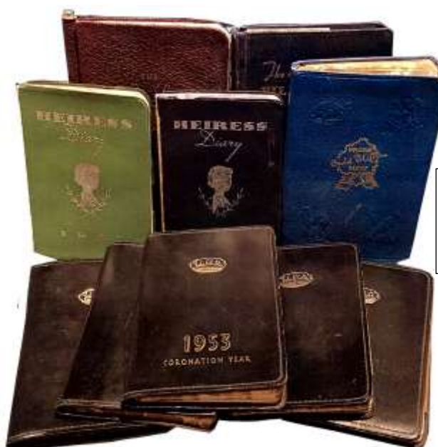
Mum's (back) and grandad's diaries (front) 1950-1954